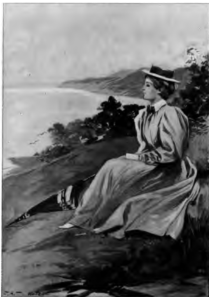
She would sit for hours with no companion save her thoughts.— Page 215